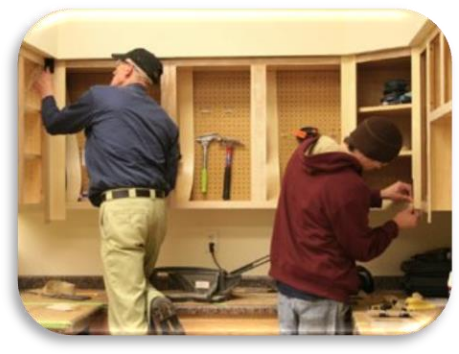
This course is subsidised by the Government of South Australia for eligible participants, visit <a href="www.skills.sa.gov.au">www.skills.sa.gov.au</a> for Participant Eligibility Criteria.